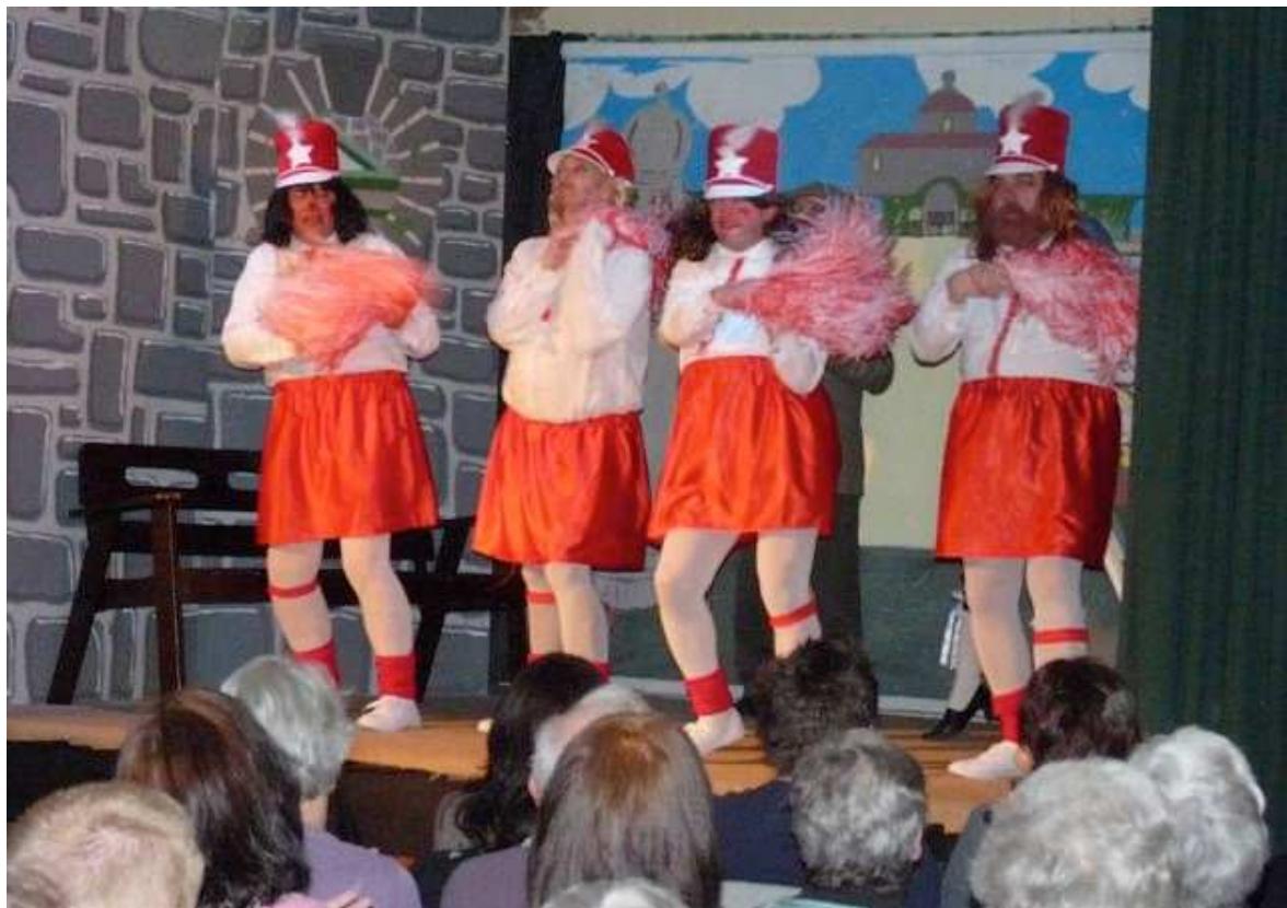
The fabulous Majorwrecks perform at Northlew's annual pantomime.