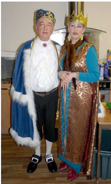
King Edward & Queen Clarinda